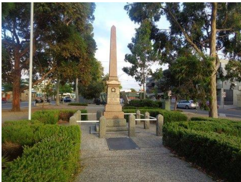
Newport War Memorial

The Newport War Memorial, located at Mason Street, Newport, Victoria, does not list individual names.