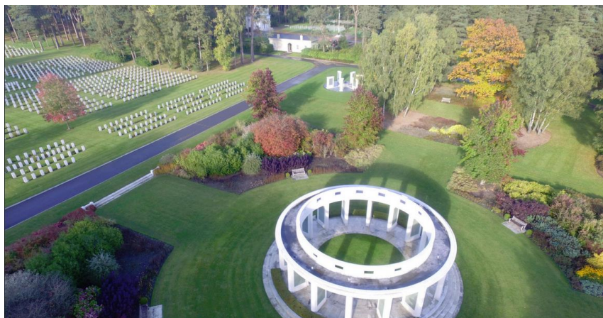
Brookwood Military Cemetery

There are 446 Australian War Graves in Brookwood Military Cemetery – 351 from World War 1 & 95 from World War 2.