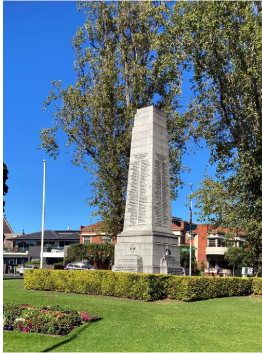
Williamstown Cenotaph